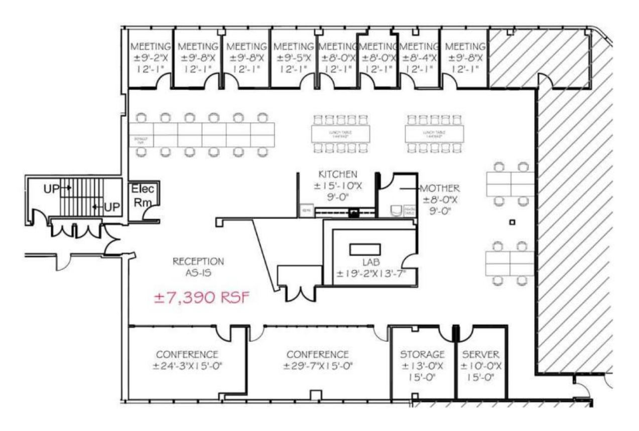
Plan Not To Scale